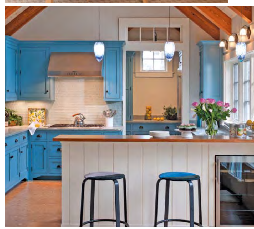
FALL 2015 | SEASIDE STYLE 93