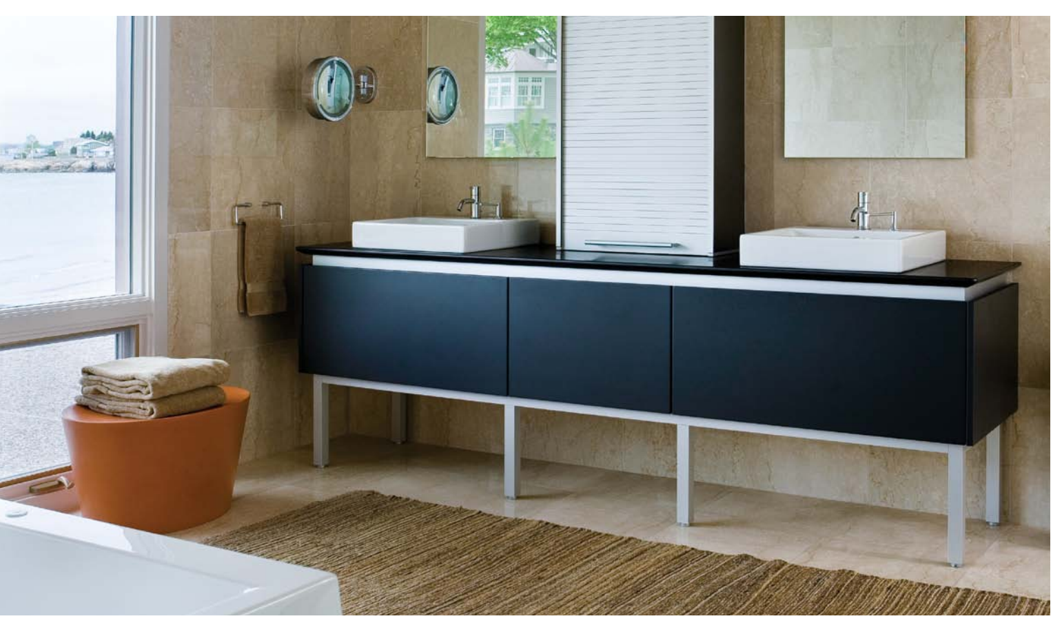
Modern laminate storage keeps clutter corralled in a clean, tidy package. Perched on square, stainless-steel legs, this vanity allows light to shine into the far reaches and lighten the room.

Working enough storage into limited bathroom space is like putting together a puzzle. Everything needs to fit together, and there are a lot of pieces to choose from. Vanities run the gamut from undersink varieties to ceiling-high linen cupboards. Fittings can go behind doors and inside drawers. Storage can be fitted with drawers, shelves, tilt-out hampers, wire baskets, or cubbies for small items. You can even trick out your cabinets with warming inserts for towels or create tub-side storage that has a space for a small flat-screen TV to maximize fun and function.