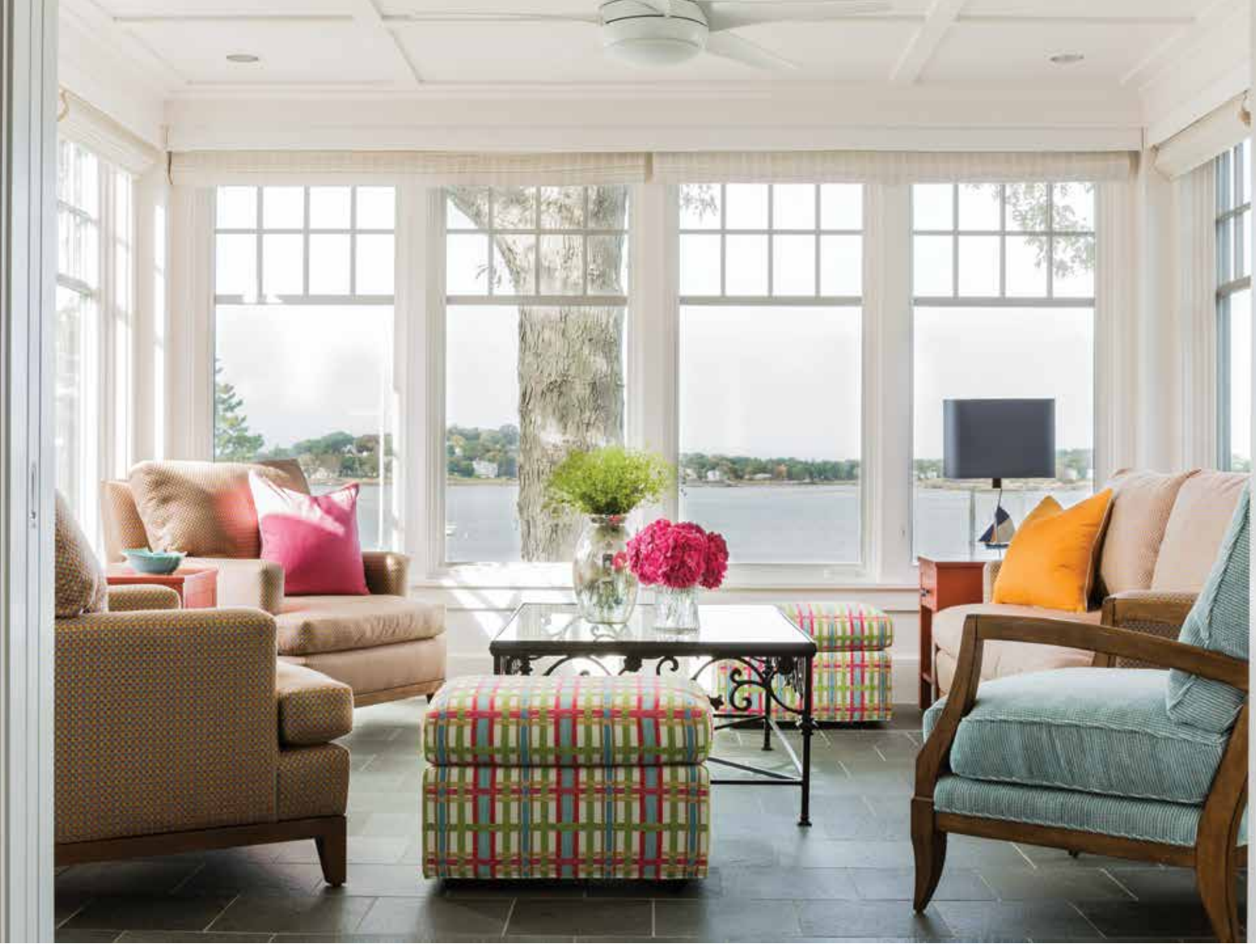
designed a valance and matching seat cushions in a rainbow-motif fabric of watermelon, tangerine, lemon and lime for the breakfast nook. (Above) Large windows provide sweeping views of Hingham Harbor and World's End.