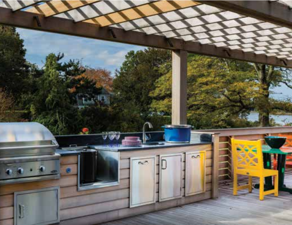
The home's outdoor kitchen includes a stainless steel built-in grill, a massive burner made to accommodate oversized pots (especially for lobsters) and candy-colored furniture.

nside the airy foyer, azure wallpapered walls soar 19 feet to meet a hip eyebrow dormer. Brilliant light dances into the home through two custom designed sidelight windows (there's a toplight too) with swirls of pink flowers and vines. The look is dainty, feminine and reminiscent of the French countryside.