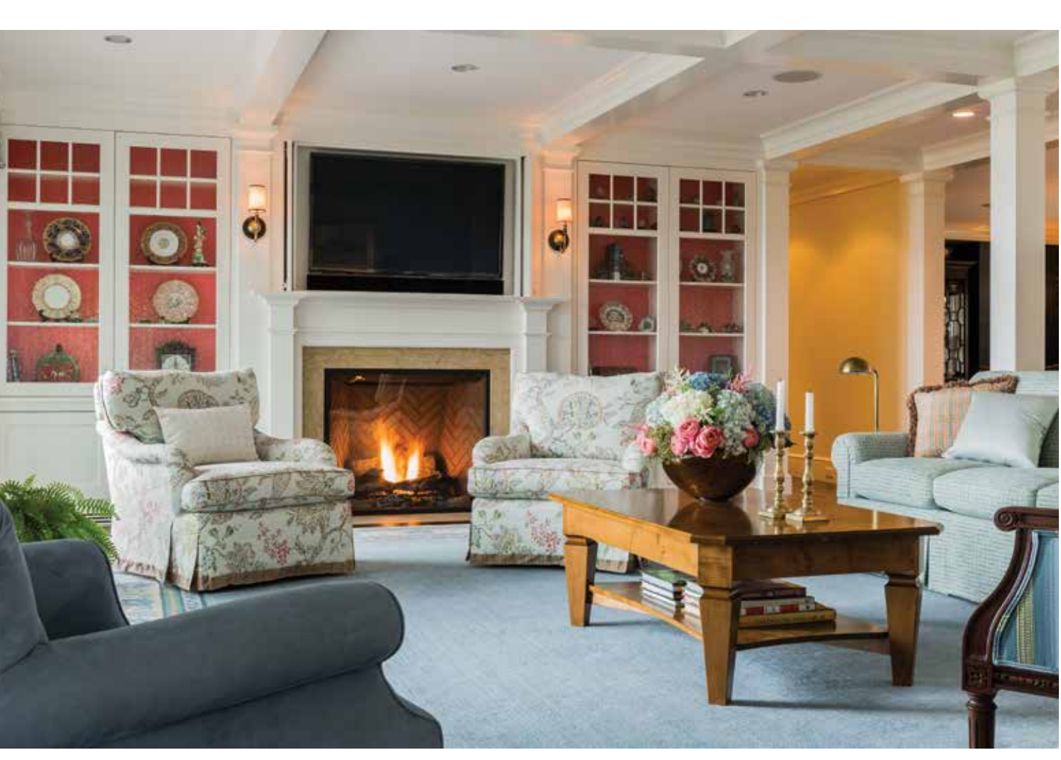
Upholstered chairs in muted pastels outfit the grand living room.