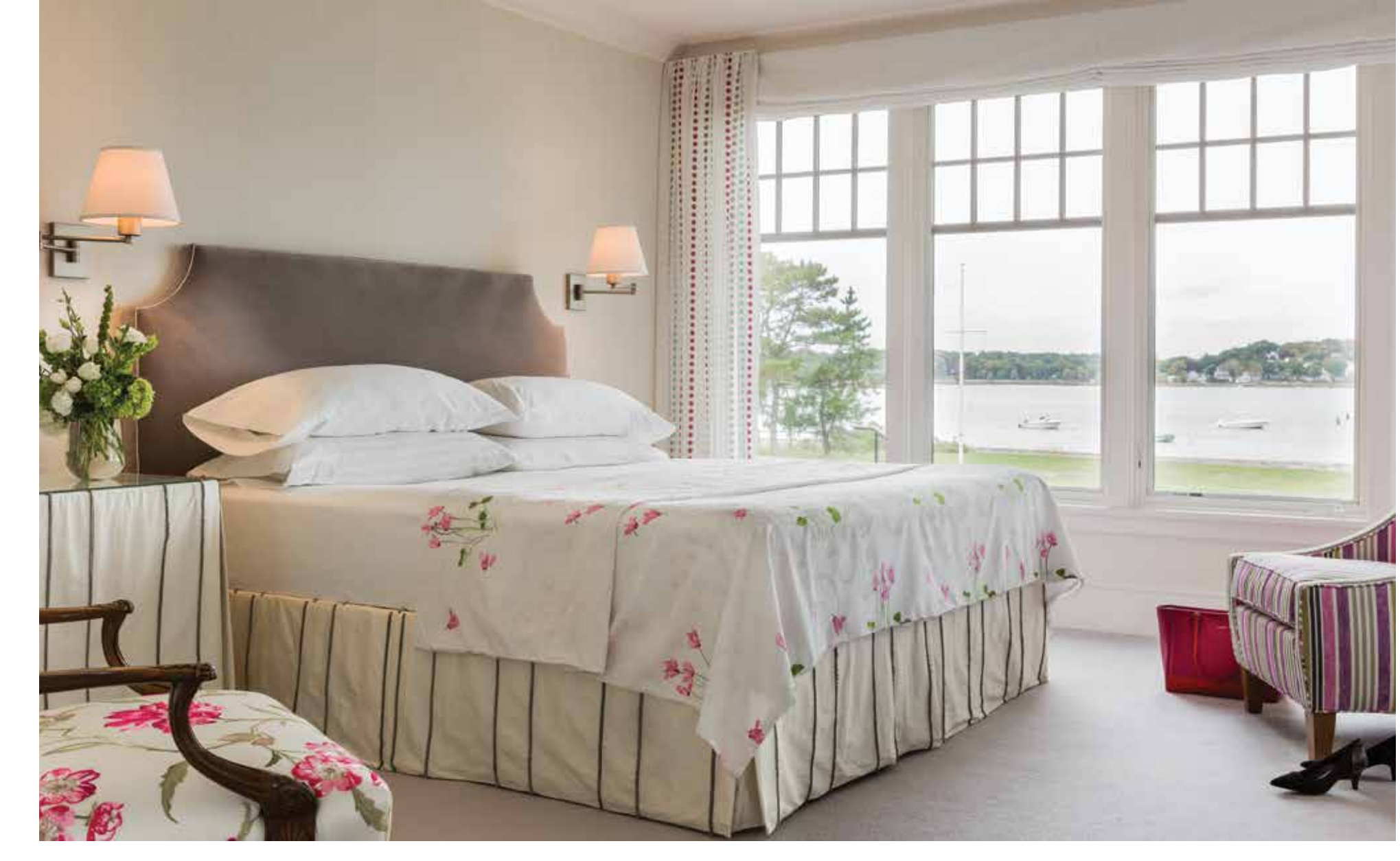
(Above) The bedroom décor was kept light and airy, with delicate touches of color. (Right) The master bath has a raspberry ceiling, double sinks and a soaking tub.